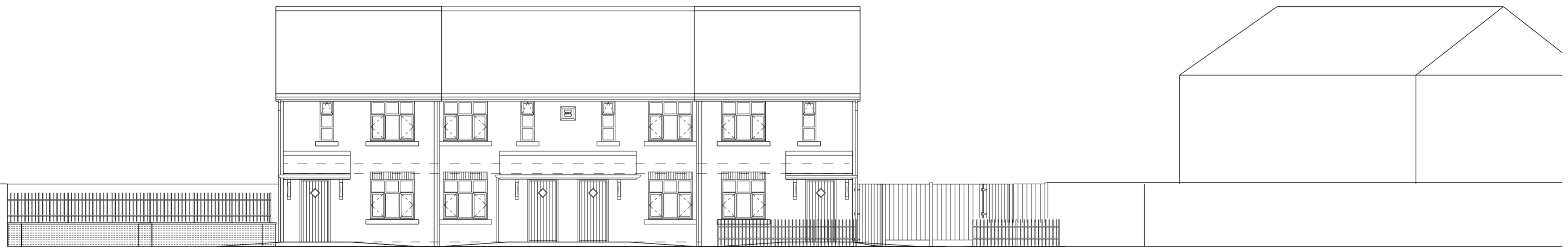
Proposed Street Elevation (South West Elevation)